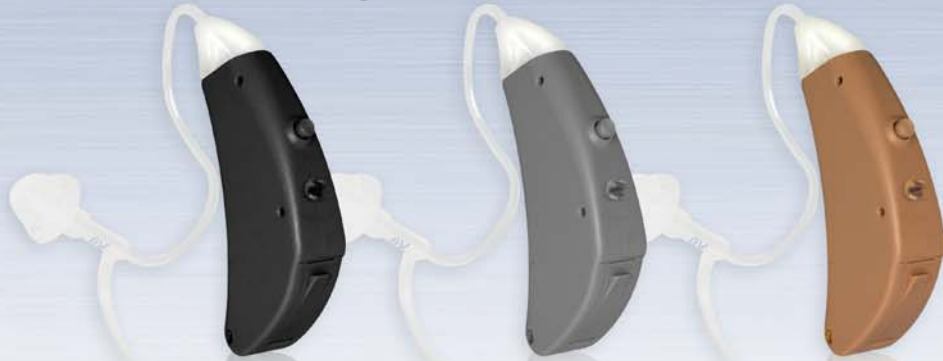
The Quick Fit™ Series is available in black, charcoal and tan. (Shown larger than actual size.)