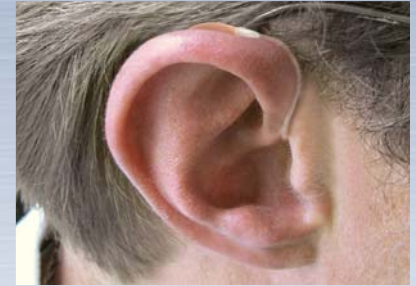
Quick Fit™ is small enough to be worn behind the ear and its thin tubing makes it virtually invisible.